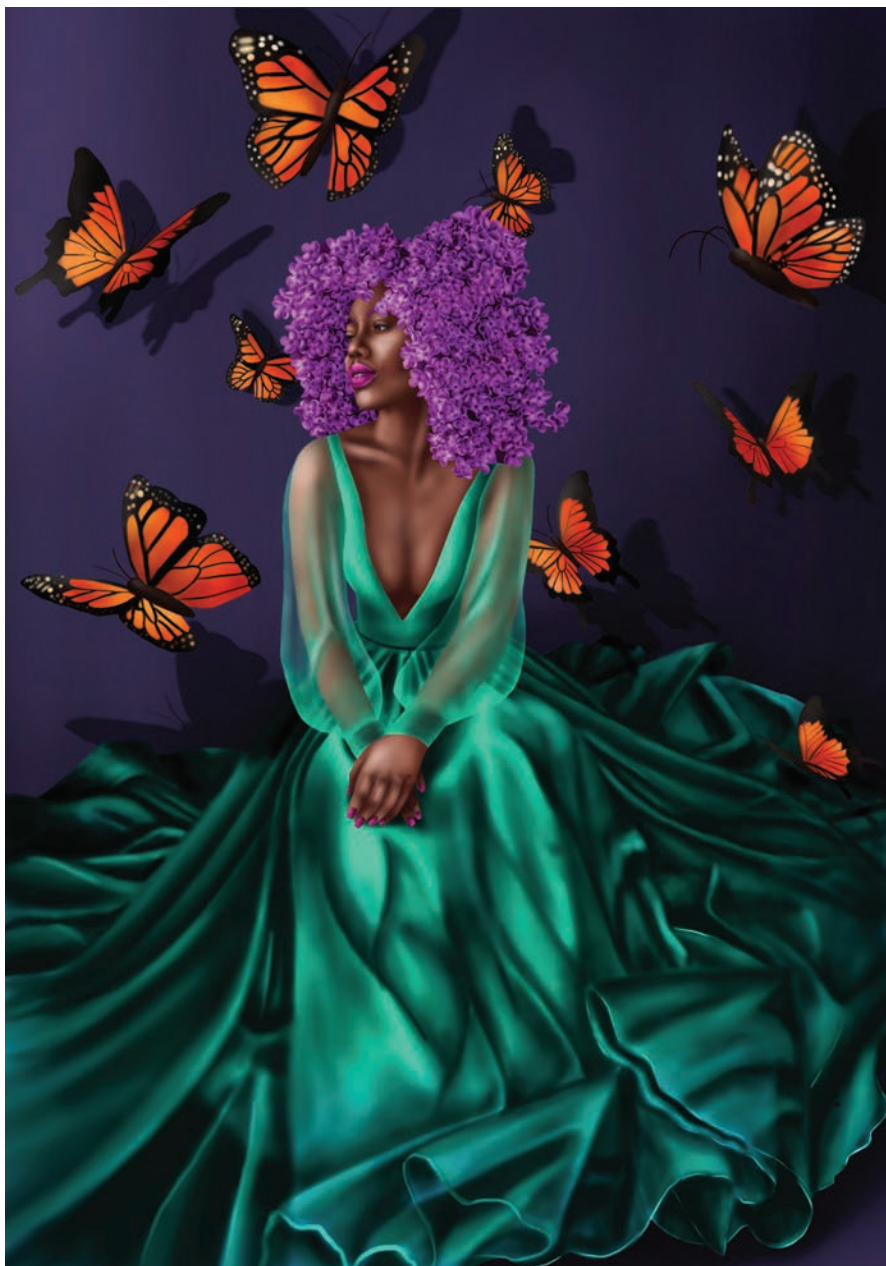
Butterfly Kisses Digital Illustration by Kaitlyn Tibbitts Drawing, Undergraduate