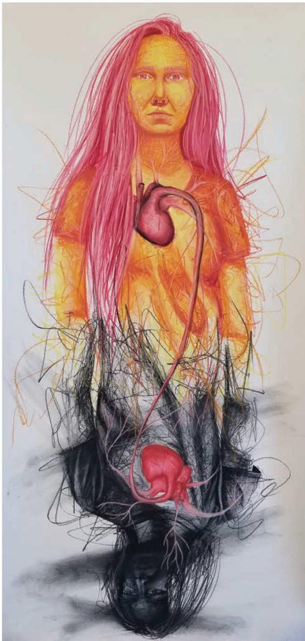
Always Keep Fighting Illustration, Charcoal/Pastels by Kaitlyn Tibbitts Drawing, Undergraduate