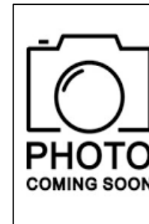
Estelle Cheng – RH 237