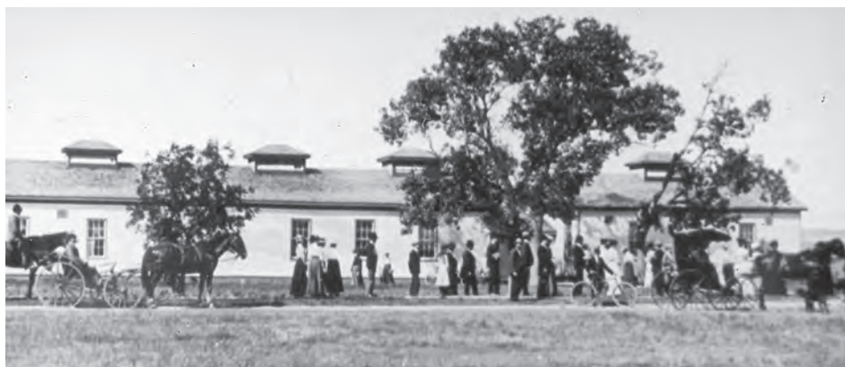
Opening Day of the Western Branch of Kansas State Normal School on the grounds of the old Fort Hays Military Reservation.