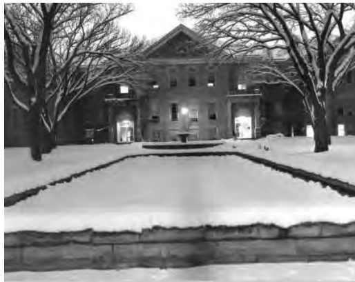
Right: Snow covers the fountain in front of Picken Hall.