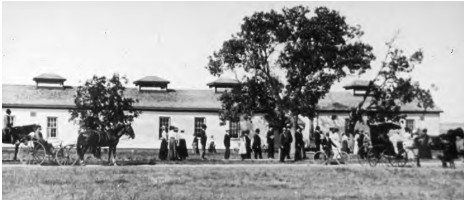
Opening Day of the Western Branch of Kansas State Normal School on the grounds of the old Fort Hays Military Reservation.