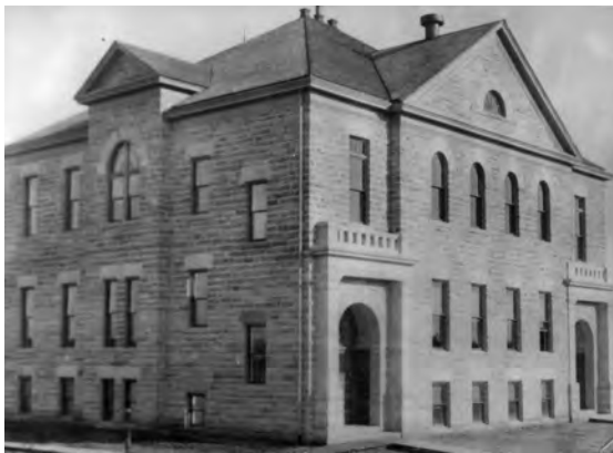
Left: Picken Hall, the first academic building on campus.