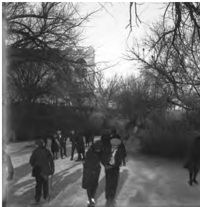
Left: People skate on Big Creek with Sheridan Hall in the background.