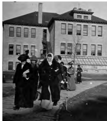
Right: South side of Industrial Building with greenhouse; women are walking away from the building on sidewalk.