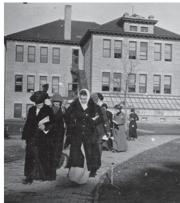
Right: South side of Industrial Building with greenhouse.