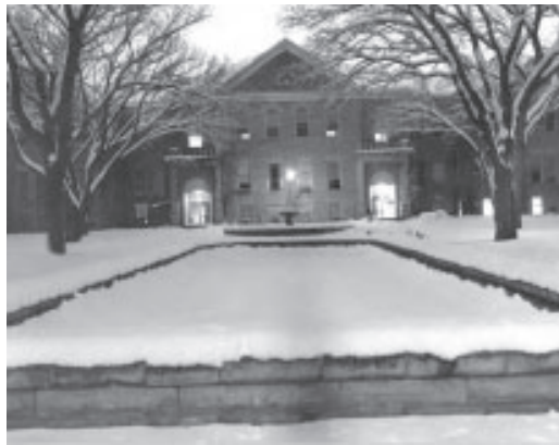
Right: Snow covers the fountain in front of Picken Hall.