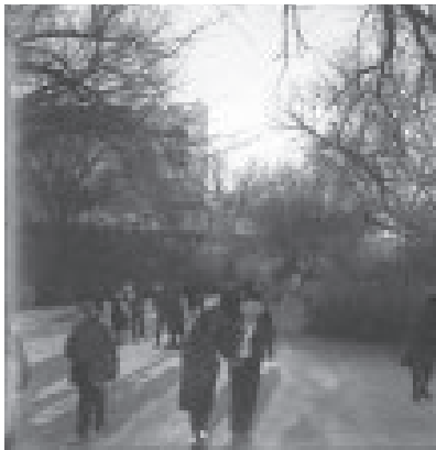
Left: People skate on Big Creek with Sheridan Hall in the background.