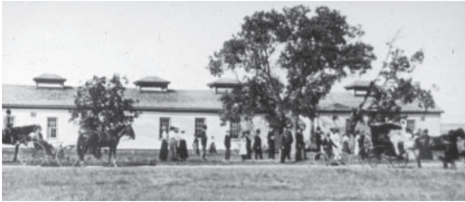
Opening Day of the Western Branch of Kansas State Normal School on the grounds of the old Fort Hays Military Reservation.