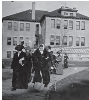
Right: South side of Industrial Building with greenhouse.