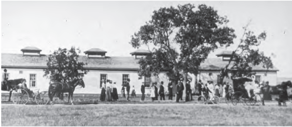
Opening Day of the Western Branch of Kansas State Normal School on the grounds of the old Fort Hays Military Reservation.