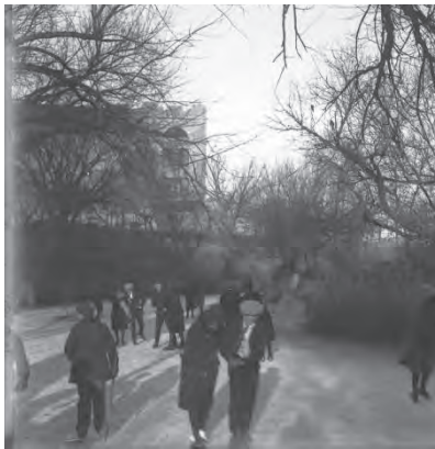
Left: People skate on Big Creek with Sheridan Hall in the background.